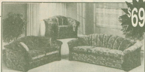
Love Seat and Chair, 3 pce. Choice of fabric. Reg. $999. $100 Extra for Sofa Bed.