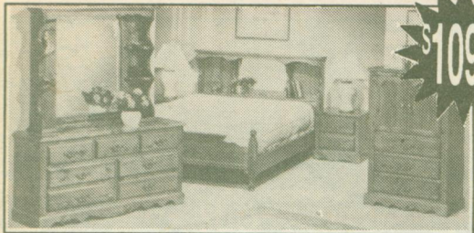
Solid pine, 6 pce. complete bedroom suite. Choice of stain and style. Reg. 1,999.