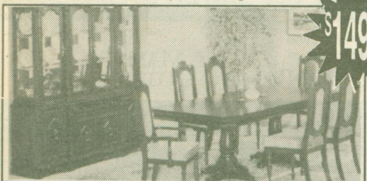
Dining Room Set, 9 pce., contemporary oak, all wood, spacious buffet base, dble. pedestal table with extension, 4 side chairs, 2 captain's chairs. Choice of fabric and stain. Reg. $2699.