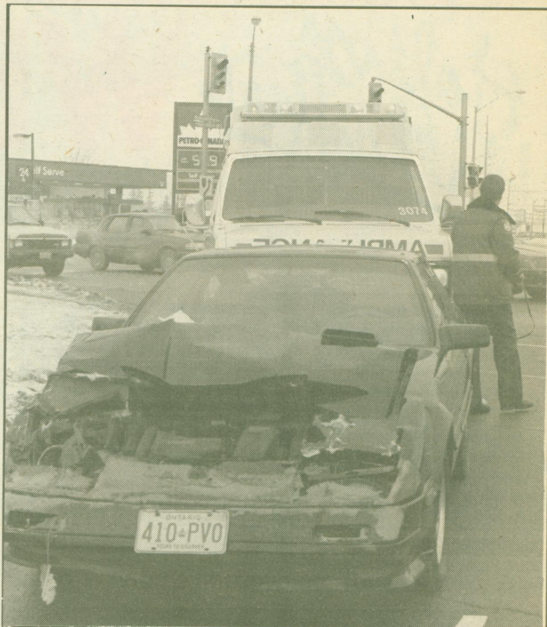
Minor injuries resulted from Thursday morning's traffic accident at the corner of Guelph Street and Mountainview Road. A car turning south onto Mountainview from Guelph was rear-ended by another vehicle. The driver of the car that rammed the rear bumper of the other vehicle was charged with careless driving. Halton Regional Police and Halton Hills Ambulance Service responded.

He added that police are following up on complaints about the calls. Anyone wanting to report receipt of such a phone call or concerned about the issue can call the Crime Prevention Office, Halton Regional Police Service, 11 Division, Georgetown, at 878-5511, Ext. 2120.