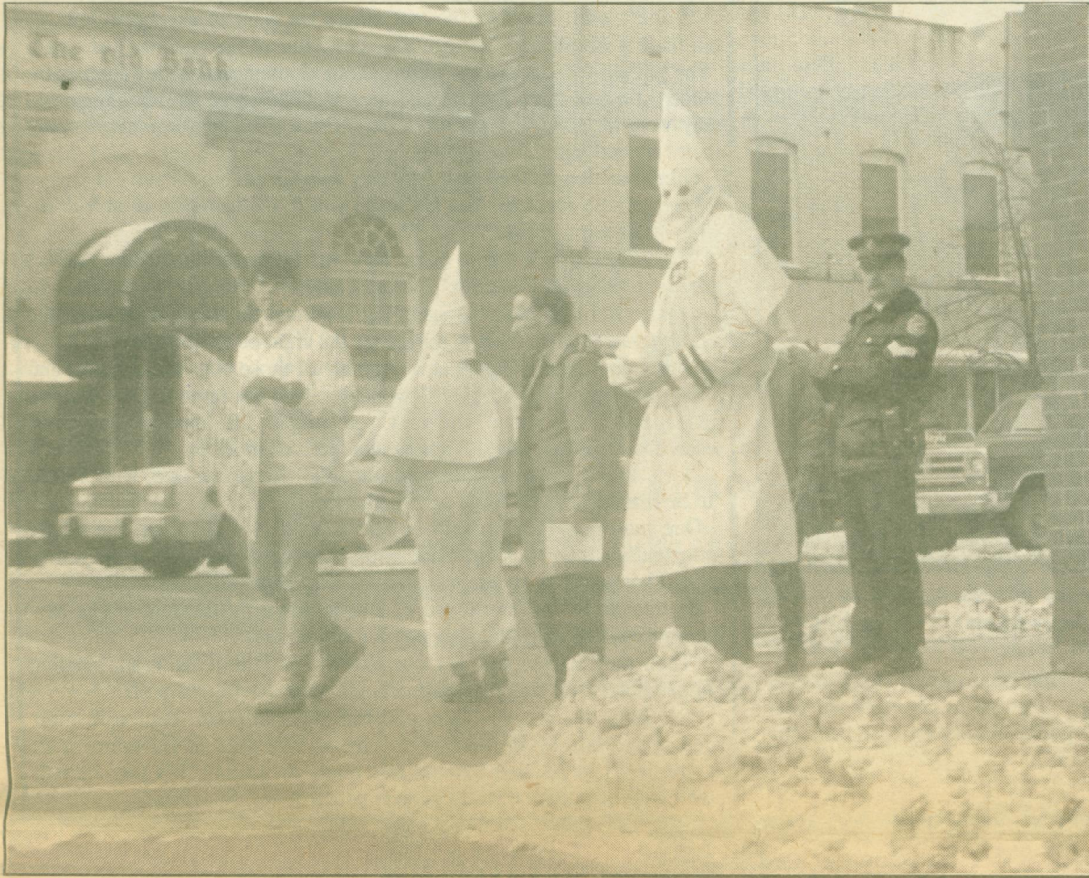
Ku Klux Klan members handed out literature about the organization at Georgetown's four corners Saturday afternoon under the scrutiny of Halton Regional Police. The Klan members visited Georgetown after a short stop in Acton.