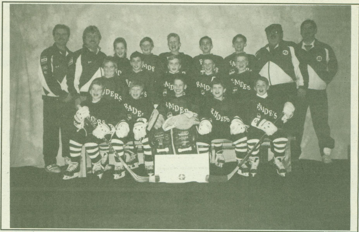
Members of Georgetown's Beaver Lumber Major Novice Raiders took time to savor their victory at the Milton Beaver Tournament on the weekend.

Tuesday, January 12 6 - 8 p.m. Tuesday, February 16 6 - 8 p.m. ("REP" players must be registered by this date) Saturday, March 27 10 a.m. - 2 p.m. Wednesday, April 7 6 - 8 p.m. (Late registration - add $10) Gordon Alcott Arena (upstairs) Fee - $65