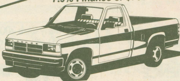
1993 DAKOTA TRUCK

Finished in Blue, V8 Eng., 230 Horsepower, Auto. Trans., Stereo Cass & More #3035