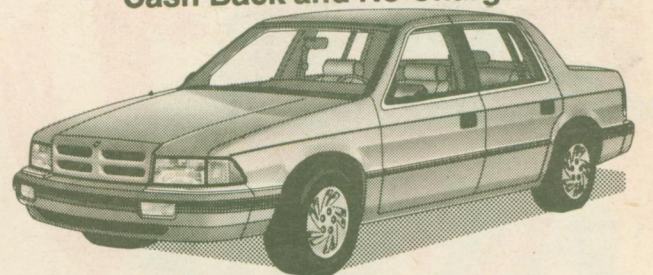
1993 DODGE SPIRIT

6.9% or $1250 Cash Back and No Charge Air