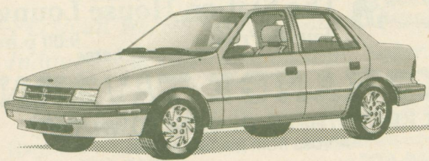
1993 DODGE SHADOW