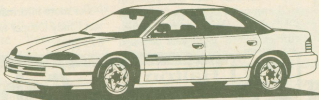
Finished in Charcoal, Air Cond., Tilt, Cruise, Stereo Cass., V6 Eng & More #3007

Have We Got a Christmas Present for You 1993 DODGE CARAVAN SE