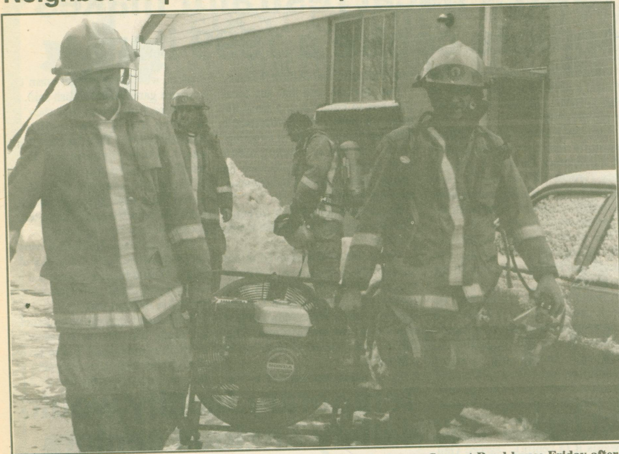
Halton Hills firefighters used smoke ejector to clear the smoke from a Sargent Road house Friday afternoon after an unattended pot on a stove caused a thick cloud of smoke to engulf the house. No one was injured but the occupant was treated for smoke inhalation.

Friday's snowstorm had at least one silver lining when a Sargent Road resident helped a next-door neighbor escape her smoke-filled home.