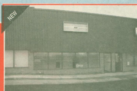
THIS MEANS BUSINESS!!

Ideal location for 3 townhouses, 2 links or income property. Zoned R4 and waiting for your project. Perfect for small builder, prices have never been better so hurry on this at $129,900. RM228-92