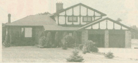
IF YOU YEARN FOR THE COUNTRY

This home is what you have been waiting for; 4 large bedrooms, master ensuite, oak kitchen with breakfast nook overlooking family room with fireplace, modern decorating. Sounds nice, doesn't it. This home offers everything you desire for only $284,900. RM193-92