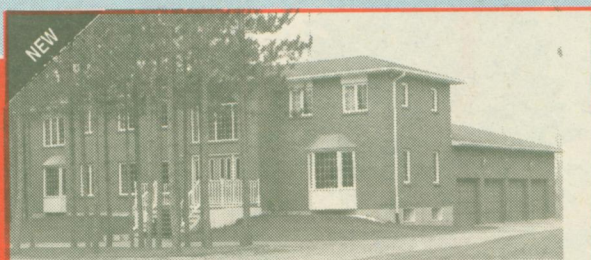
THE TALL PINES

Picture yourself in this executive 4200 sq. ft. 4 bedroom home with 5 washrooms, Scarlet O'Hara staircase and entranceway, 4 car garage, gourmet kitchen with Jennair and built-ins, central air, central vac., gas furnace and much much more on a one acre lot. Priced to sell at $349,900. RM301-92