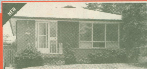
LOUNGE BY THE POOL

Picture yourself in this executive 4200 sq. ft. 4 bedroom home with 5 washrooms, Scarlet O'Hara staircase and entranceway, 4 car garage, gourmet kitchen with Jennair and built-ins, central air, central vac., gas furnace and much much more on a one acre lot. Priced to sell at $349,900. RM301-92