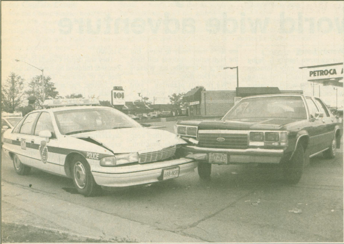
This Ford attempted to make a left turn from Guelph Street (across the eastbound lanes) last Friday and collided with, ouch, a police cruiser. Charged with making an unsafe turn is a 42-year-old Georgetown woman.