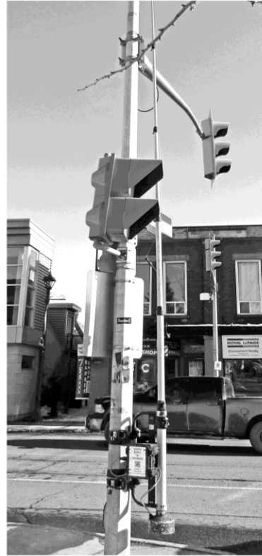
Special monitoring equipment attached to the light standard at Mill & Main Streets.

expected to see an increase in traffic to more normal levels of those seen in the time prior to the pandemic.