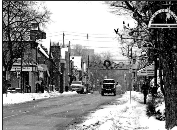
Winter Wonderland: It was definitely a white Christmas in Downtown Acton as quite a bit of snow fell upon Acton and area during late December, making for a wintry scene.