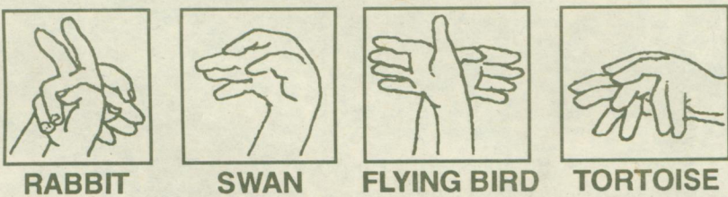
RABBIT SWAN FLYING BIRD TORTOISE