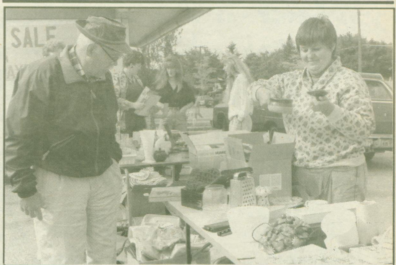
Moore Park Daycare held a successful garage and bake sale fundraiser last Saturday. Money raised will go towards the purchase of toys and a fridge. Here a pair of bargain hunters search for that "just right" item.