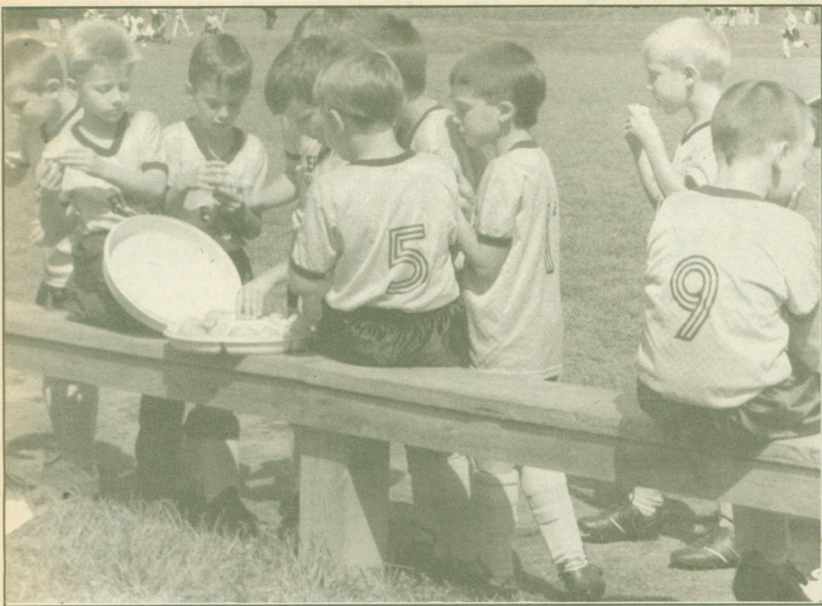
A bit of refreshment was well deserved at Cedarvale last week during Youth Soccer's Day of Champions.