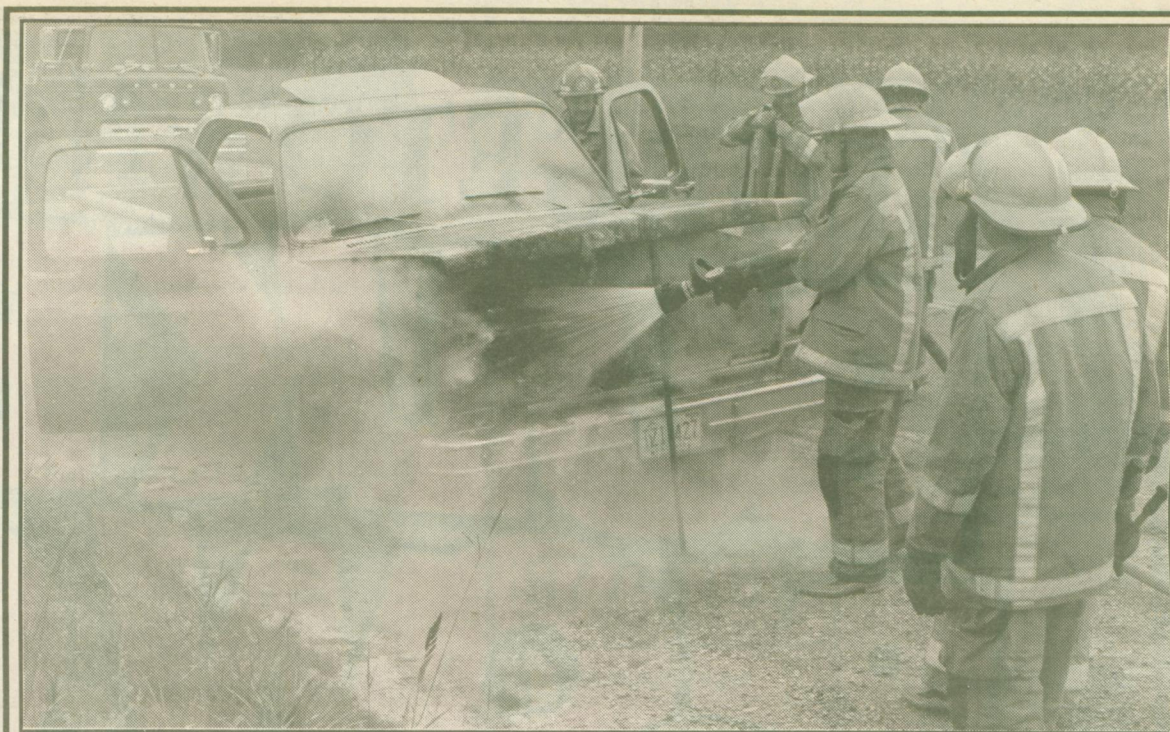
Halton Hills firefighters were quick to extinguish a pickup truck fire Tuesday. The truck was travelling on Trafalgar Road south of Highway 7 at about 4:20 p.m. when flames broke out.

We also see Cedar Waxwings which have come to eat the small fruit off our neighbour's tree. They appear in late fall when the fruit is ripe and mushy, and again in February if there is fruit left on the tree. These times are probably during the bird's migration. The Cedar Waxwing is recognized by the smooth and silky appearance of the feathers, by its crest and red wax-like spots on its wings. Their tails