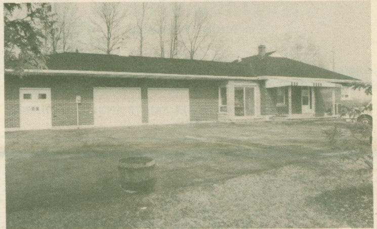
1600 SQ. FT. HOME FOR $169,000

Can you ask for any more?? Yes you can. Try a walk-up attic, plenty of cupboards, 1/2 acre lot, 200 amp service, air conditioning, heat pump, main floor laundry, hardwood floors and paved drive. Do yourself a favour and drive by Hwy. 24 at Brucedale. Then call Orval Gates at 519-856-2207 for an appointment to see through.