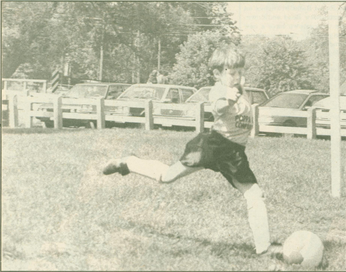
Halton Hills soccer fans were treated to a full day of events at Cedarvale Park Saturday as teams competed in league finals. This young goalie prepares to clear a ball from his goal mouth.