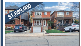
$1,689,000 2 STOREY DETACHED Highly Sought After Bloor West Village Home