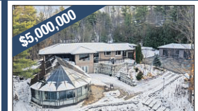
$5,000,000 DREAM HOME PRIVATE OASIS Massive 6 Bed Bungalow with Indoor Pool And Private Pond