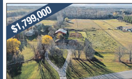
$1,799,000 BUNGALOW ON OVER 13 ACRES 3 Car Garage, 3 Separate Entrances, Barn & Pond