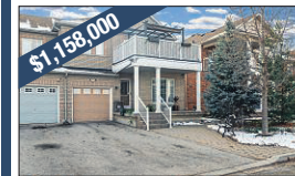
$1,158,000 PRIME VAUGHAN LOCATION End unit With Huge Walk Out Terrace