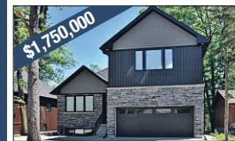
$1,750,000 STUNNING NOTTAWASAGA RIVERFRONT Newly Built Custom Home. 3+2 Bed With Open Concept Layout