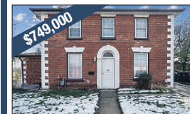
$749,000 CHARMING DETACHED Upgraded 3 Bed Home In Great Location