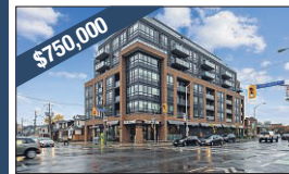
$750,000 1 YEAR OLD BUILDING 2 Beds, 2 Baths Minutes from Subway. Must See!