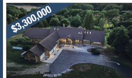
$3,300,000 CUSTOM ESTATE OVERLOOKING LAKE Over 2 Acres, Completely Renovated With Indoor Heated Salt-Water Pool & Sauna!