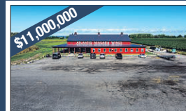
$11,000,000 ATLANTIS NIAGARA WINERY In the heart of Wine Country! Cannabin Greenhouse!! Call for more info.