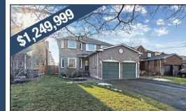
$1,249,999 FAMILY HOME On Quiet Court with Inground Pool