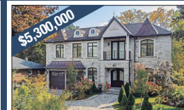
$5,300,000 STUNNING CUSTOM BUILT MANSION Premium 82 X 222ft Lot, Massive 5+3 Beds, 6 Baths With 4 Car Garage