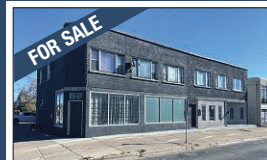
FOR SALE 11 UNIT MIXED-USE PROPERTY Opportunity In High Demand Location near Future Go Station. 10 Residential Units, 1 Commercial

* FOR UNITS OF LISTINGS SOLD ACCORDING TO A STUDY OF MLS DATA PREPARED BY AN INDEPENDANT AUDITOR FOR REAL ESTATE STATISTICS FOR 2015, 2016, 2017, 2018, 2019, 2020 and 2021