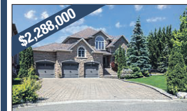
$2,288,000 BEAUTIFUL EXECUTIVE HOME ON QUIET COURT Premium extensively landscaped lot!