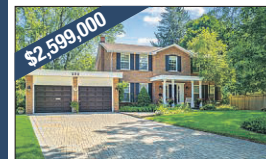
$2,599,000 LARGE 68'X 152' LOT ON QUIET COURT 4 bdrm Estate Home with amazing backyard retreat in desired Mill Pond!