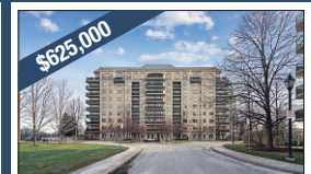
$625,000 CONSERVATION VIEWS Corner Unit With 2 Beds & Wrap Around Balcony