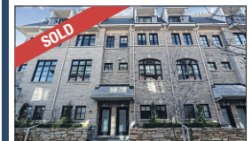
SOLD ETOBICOKE BY THE LAKE! SOLD FOR TOP $$$!!