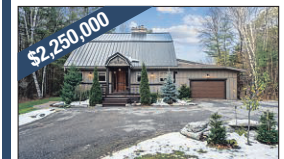
$2,250,000 UPSCALE COUNTY RETREAT Fully Updated! Entertainers Dream with Outdoor Kitchen on 3.8 Acres