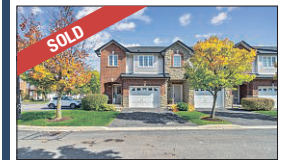
SOLD END UNIT TOWNHOME SOLD FOR TOP $$$!!

WE'RE HIRING! WE ARE LOOKING FOR 2 MOTIVATED LICENSED REALTORS. GO TO JOINTEAMLEO.COM TO SKYROCKET YOUR CAREER!!