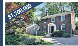
$1,700,000 UPGRADED 2 STOREY Backyard Paradise with Inground Pool on 60x180 Dream Lot