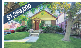
$1,289,000 AMAZING LONG BRANCH OPPORTUNITY Turn key bungalow on extra deep lot. Live in or build custom and be steps to everything!