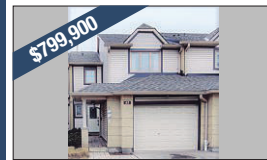
$799,900 TASTEFULLY RENOVATED Townhome In Top Ranking School District