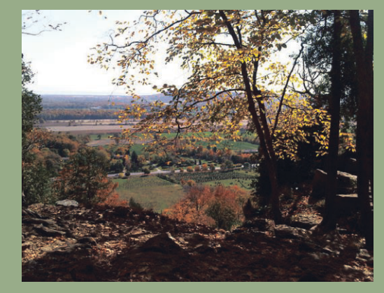
with a better view...