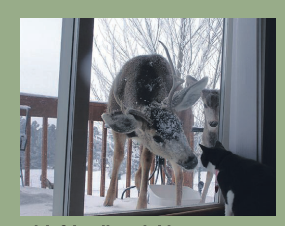
with friendly neighbours...