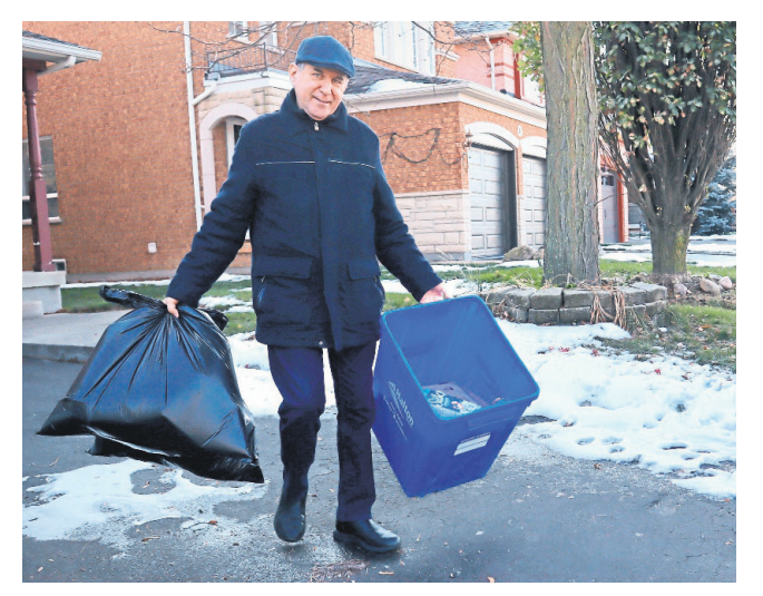
Reeti M. Rohilla/Metroland

Likely due to the pandemic, Halton saw a significant increase in waste generated in 2020, shared the region's website. It added that continuation of these elevated levels could shorten the life of the Halton Waste Management Site (HWMS) — currently expected to stay open until