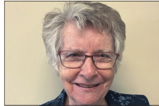
JULIE CONROY Column

There are several activities that have returned to Hillsview Acton, including shuffleboard, which is now on Wednesdays at 4 p.m., and canasta on Thursdays at 1 p.m.