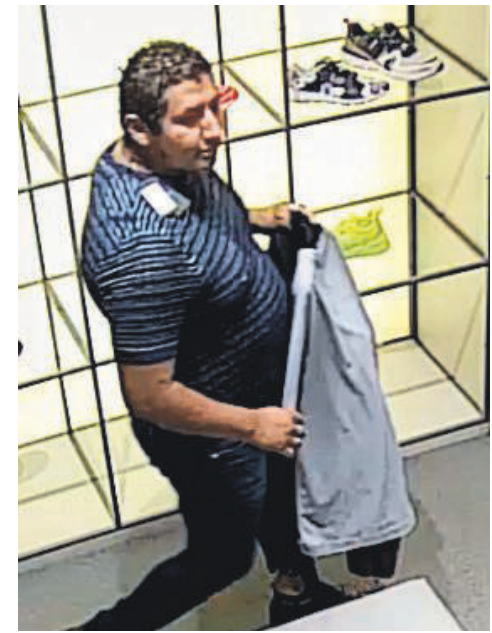
Halton police are looking for information about the man who allegedly stole retail merchandise worth over $10,000 on Aug. 14.

as being about 5-foot-5 and in her 40s with long black hair in a bun. She was wearing a long-sleeve striped top, short brown skirt and white sneakers.