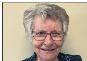
JULIE CONROY Column

TRIP TO IRELAND EXTREMELY MEMORABLE, WRITES JULIE CONROY