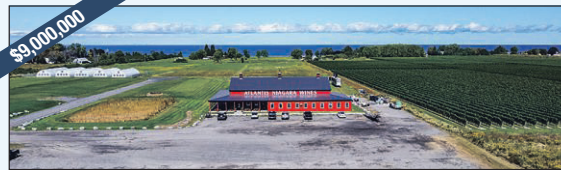
ATLANTIS NIAGARA WINERY + CANNABIS

WE LIVE AND WORK IN YOUR AREA! GET MORE FOR YOUR PROPERTY! LET US SHOW YOU HOW!