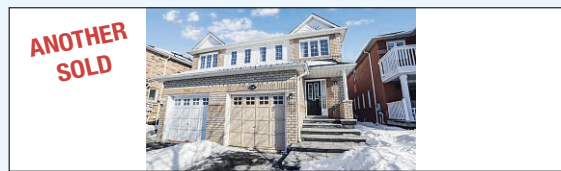
BEAUTIFUL UPDATED HOME

Spacious 3 bedroom, 3 bathroom home with finished basement. Situated on a 142ft deep lot, located in high demand family friendly area. Minutes to major shopping, transit and Highways 401/407/410! Don't miss out!