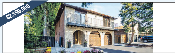
PREMIUM 85X228 LOT!

450 ft of Waterfront!! Stunning 6 bed, 5 bath home on 4.73 acres with sandy beach waterfront on Farlain Lake. Almost 6000 sqft of fully updated living space. Separate 3 car garage, plus heated workshop. Stunning views, quiet and private. The perfect staycation!