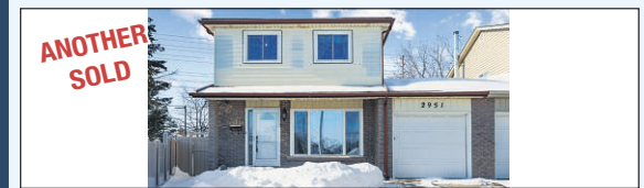
QUIET CUL DE SAC

Renovated 4 bedroom, 3 bath on huge pie-shaped lot. Designer kitchen w/quartz counters, stainless steel appliances, pot lights, walk-out to yard w/pool + hot tub. Open concept living/dining with hardwood floors. Finished basement w/3pc bath and tons of storage!