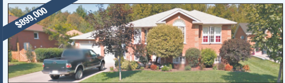
GORGEOUS RAISED BUNGALOW

Sitting on large private lot! Located on a quiet street in the great community of Everett. Close to amenities. Beautifully finished lower level giving plenty of room to entertain family and friends. Not to be missed!