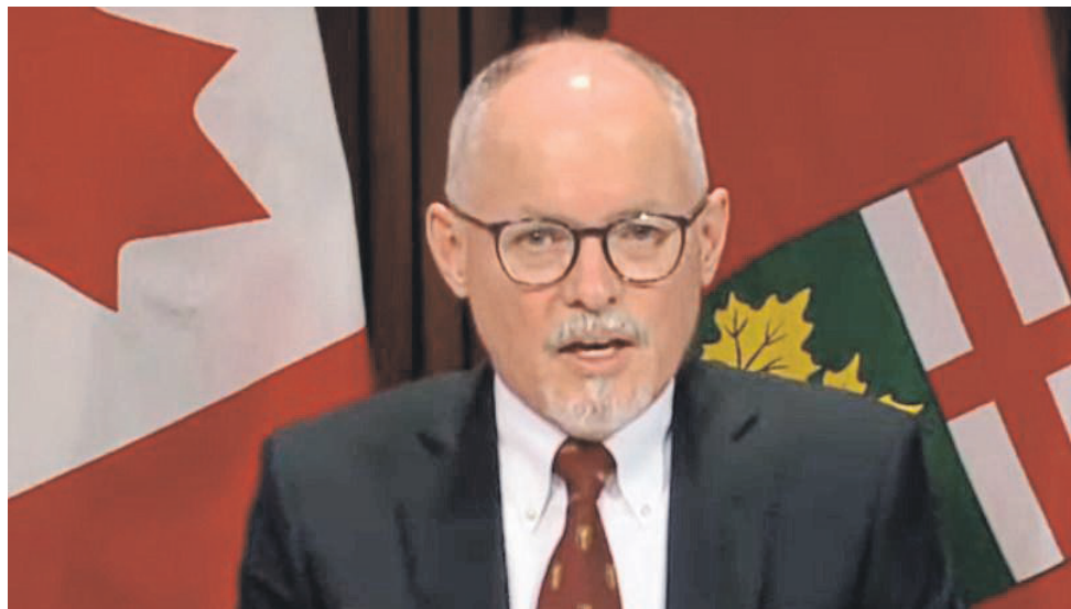
YouTube screen capture

The distribution of rapid antigen tests throughout