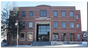
DOWNTOWN GEORGETOWN 83 Mill St | 905 873 1867

We are open but due to the current virus situation we are seeing patients by appointment only. If you are planning a visit (for routine eye examinations, eyewear purchase and repair, contact lens pick up etc), please contact us in advance and we will arrange an appointment time for you. This will help to ensure we keep everyone safe!