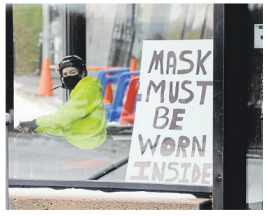
Halton's mask bylaw will now remain in effect until April 30, 2022.

Please contact us, as soon as possible, if you have any accessibility needs at Halton Region events or meetings.