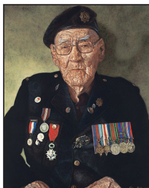
Normandy Warrior Painted by Elaine Goble in 2020