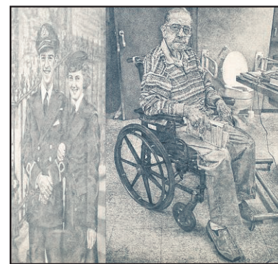
The Propagandist Drawn by Elaine Goble in 2006