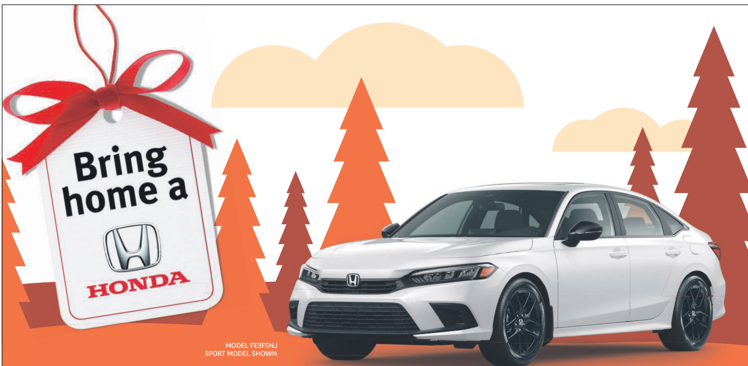
MODEL FE2F5NJ SPORT MODEL SHOWN

Since March of 2020 HCDSB had complied with the guidance of the Ministry of Education, the Ministry of Health and the region's medical officer of health, replied Daly.