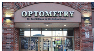
METRO PLAZA 371 Mountainview Rd S | 905 873 1861

We are open but due to the current virus situation we are seeing patients by appointment only. If you are planning a visit (for routine eye examinations, eyewear purchase and repair, contact lens pick up etc), please contact us in advance and we will arrange an appointment time for you. This will help to ensure we keep everyone safe!