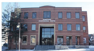
DOWNTOWN GEORGETOWN 83 Mill St | 905 873 1867

We are open but due to the current virus situation we are seeing patients by appointment only. If you are planning a visit (for routine eye examinations, eyewear purchase and repair, contact lens pick up etc), please contact us in advance and we will arrange an appointment time for you. This will help to ensure we keep everyone safe!