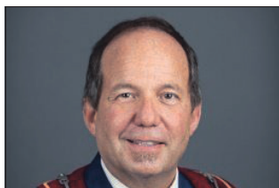
RICK BONNETTE Column

This year, the annual Culture Days events will be held Sept. 24 to Oct. 24, promising more than 60 self-led, do-it-yourself virtual and in-person activities that showcase a wide range of art forms and include activities for all-ages.