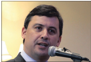
MICHAEL CHONG Column

PLENTY OF CHANGES NEEDED TO STRENGTHEN OUR COUNTRY, WRITES MICHAEL CHONG