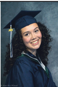
Graduation June 28, 2021