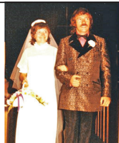
We're celebrating! July 1, 2021

50th wedding anniversary! June 26th 1971.