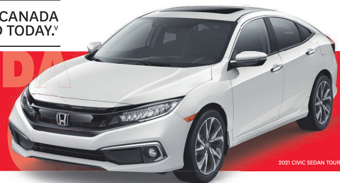
2021 CIVIC SEDAN TOURING