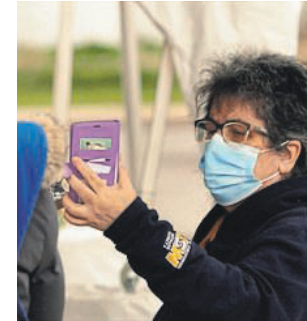
Here's a weekly roundup of COVID-19 cases and news.