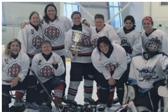
The GHHC Oldtimers Tournament's first Ladies Champions, the Arctic Blaze