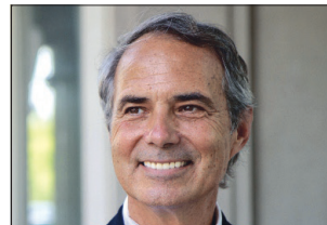
GARY CARR Column

The facility will operate 24/7 — resulting in at least 1,600 new trips to and from the facility each day by