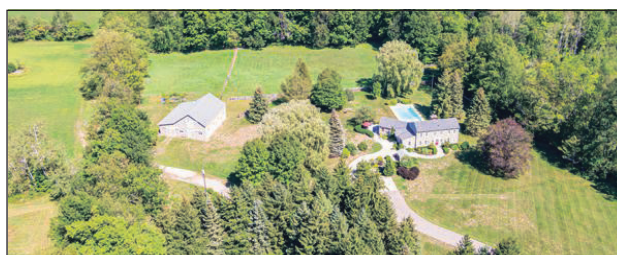
72 ACRES ON NINTH LINE