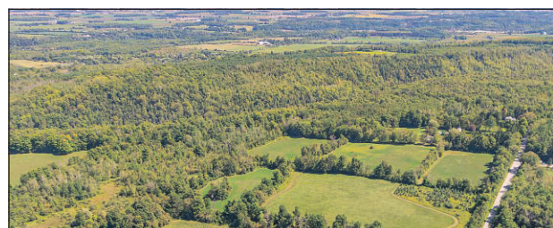
VACANT LOT IN HALTON HILLS