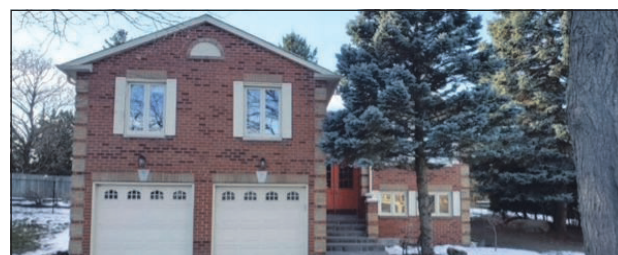
NEW IN STONEGATE