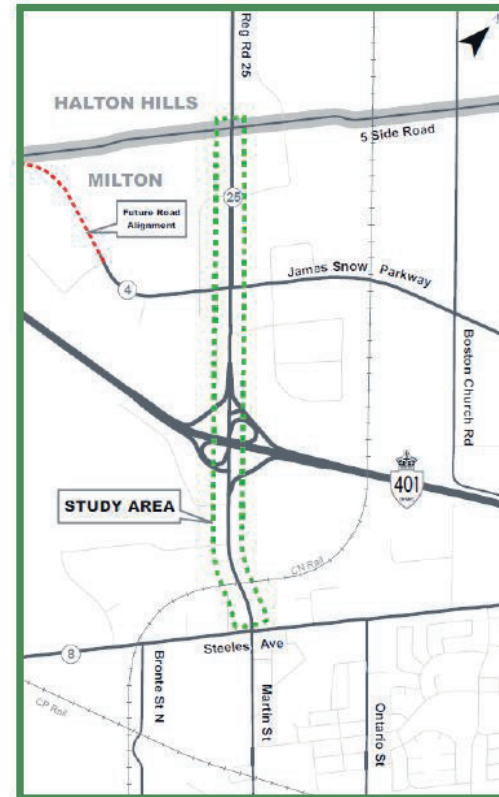
The map shows the approximate limits of the study area.