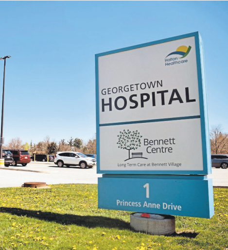
Georgetown Hospital is the beneficiary of a highly-successful fundraiser put on by The Beer Store.