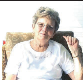
KINGSHOTT, June September 7, 2019

Mom Your life was a blessing, your memory a treasure... You are loved beyond words and missed beyond measure.