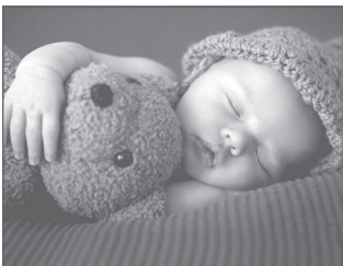
Create a keepsake your baby will treasure one day.