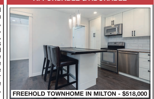
AFFORDABLE & ADORABLE