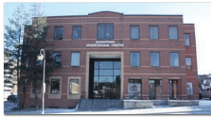
DOWNTOWN GEORGETOWN 83 Mill St | 905 873 1867

While we are currently only open for urgent eye care, we are getting prepared for a full re-opening of our offices as soon as health officials will allow. We wish to assure all our current and new patients that strong safety measures will be in place when we do open.