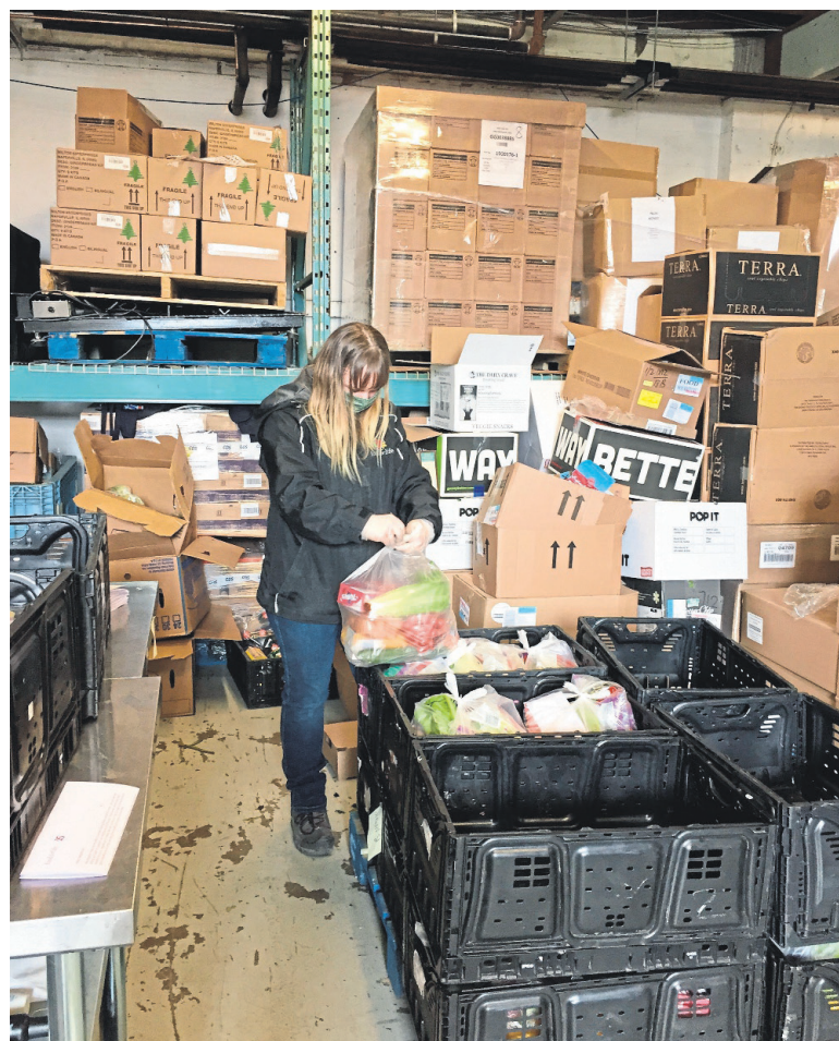
Food for Life Halton pre-packaged 770 bags of groceries on a single day last week, 600 of which will go to seniors across Halton region.