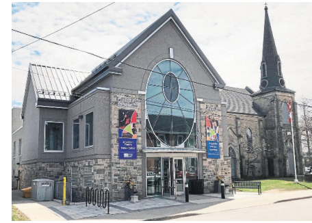
The Halton Hills Public Library Georgetown branch.

terloo, released designs for two types of face shield for front-line workers, that, while pending Health Canada approval, are being provided to hospitals and health-care providers in need.