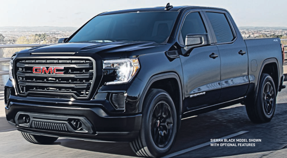
SIERRA BLACK MODEL SHOWN WITH OPTIONAL FEATURES