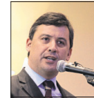
MICHAEL CHONG Column

ENVIRONMENTAL ASSESSMENT FINDINGS PROVE FEDERAL GOVERNMENT SHOULD REJECT THIS PROJECT, WRITES MICHAEL CHONG