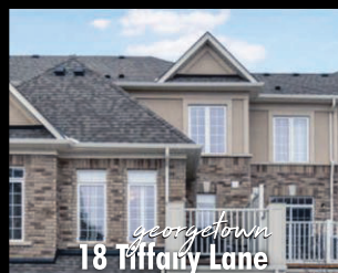
georgetown 18 Tiffany Lane

Year Round Lake Living $412,800 mls X4689459