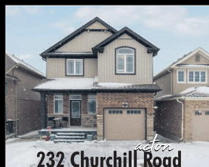
acton 232 Churchill Road

Nicely Updated-Quiet Street $884,900 mls W4630538