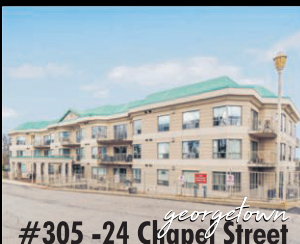
georgetown #305 -24 Chapel Street

Finoro Built - Extra Deep Lot $899,900 mls W4670868