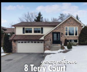
georgetown 8 Terry Court