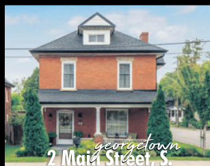
georgetown 2 Main Street, S.