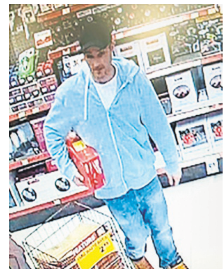
Police are looking to identify this man in connection to the theft of a saw from an Acton hardware store.

Anyone with information can call police at 905-825-4747 ext. 2281. Anonymous tips can be submitted through Halton Crime Stoppers at www.halton-crimestoppers.ca .