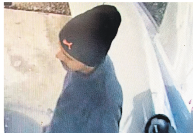
Halton Regional Police Service p

Police said the licence plates are on file as "missing" from the Ministry of Transportation.